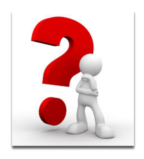
Yes and No

Isn't the University exempt from Federal Income Tax?